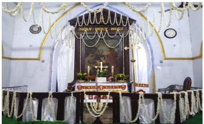
The Church in Pandur on Palm Sunday (left) and Easter (right)

On Easter Sunday, the Dawn Service was conducted by our local Pastor in the colorful illuminated cemetery where also many people gathered. On this Easter Sunday too the procession to the grave-yard was accompanied by the village choir of Pandur -exactly at 4.30 in the early morning in which our girls also joined the procession. Not to mention- the church was full in and outside under the shamiana. (Panthal). The midday lunch was provided with chicken Biryani.