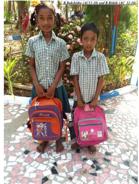
Ready for school

The date of graduation has not yet been announced by the Ministry of Education.