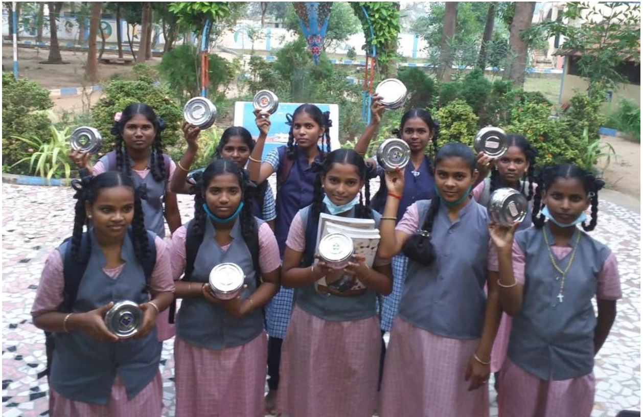
Above: A number of our girls won a prize in a writing test that took place at school in December. They proudly received the prize in January. / Below: The promised photos of the house construction.

The next transfer to India (with all special donations received until then) will probably take place in mid / end February 2022.