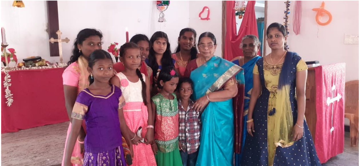
At the harvest service on 15.12.2020