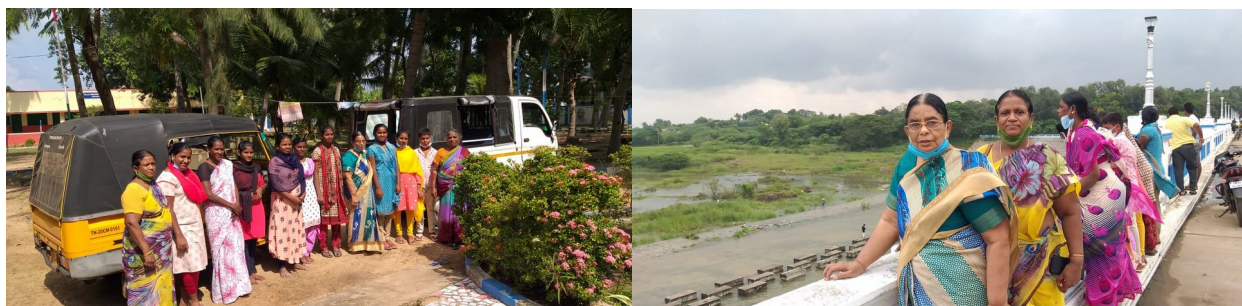
Trip to Poondi Reservoir on 1 December

Life seems to be running "normally" again, with the exception of the mandatory wearing of masks and the distance rules (both of which are being observed less and less in practice) and the continued closure of schools and kindergartens.